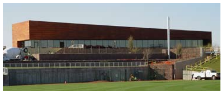
Above left: The Dodgers’ major league building beyond the left field wall. Above right: The White Sox major and minor league building beyond the right field wall.